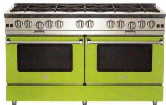
BlueStar appliance in Pantone’s 2017 Color of the Year, Greenery